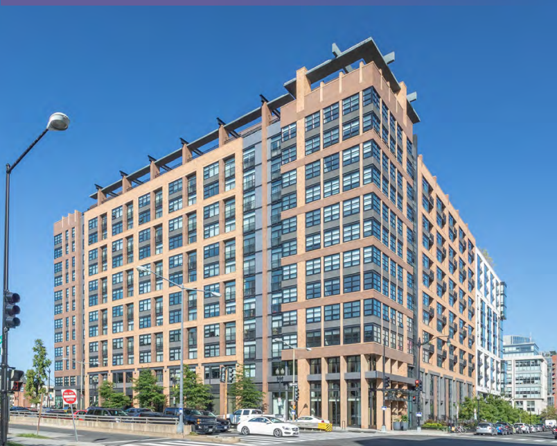
2M Street Apartments

Avanath has acquired two apartment communities: a 315-unit high-rise luxury apartment complex in Washington, D.C. and a 36-unit senior affordable housing community in Orange County, California.